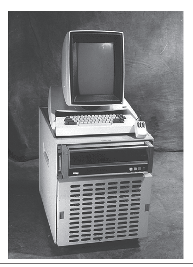
FIGURE 1.12.6 The Xerox Alto was the primary inspiration for the modern desktop computer. It included a mouse, a bit-mapped scheme, a Windows-based user interface, and a local network connection.

number that were donated to universities. Among the technologies incorporated in the Alto were: