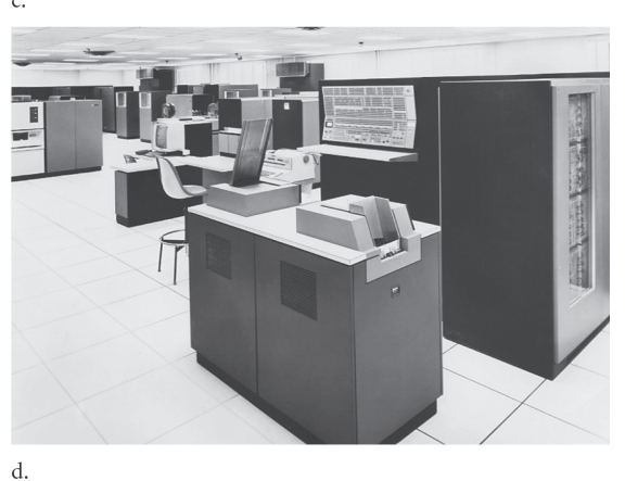
FIGURE 1.12.3 IBM System/360 computers: models 40, 50, 65, and 75 were all introduced in 1964. These four models varied in cost and performance by a factor of almost 10; it grows to 25 if we include models 20 and 30 (not shown). The clock rate, range of memory sizes, and approximate price for only the processor and memory of average size: (a) model 40, 1.6 MHz, 32 KB–256 KB, $225,000; (b) model 50, 2.0 MHz, 128 KB–256 KB, $550,000; (c) model 65, 5.0 MHz, 256 KB–1 MB, $1,200,000; and (d) model 75, 5.1 MHz, 256 KB–1 MB, $1,900,000. Adding I/O devices typically increased the price by factors of 1.8 to 3.5, with higher factors for cheaper models.