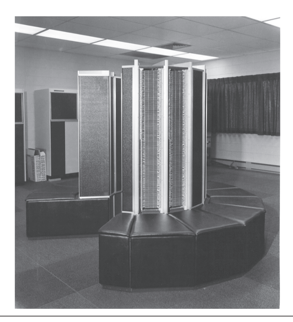
FIGURE 1.12.4 Cray-1, the first commercial vector supercomputer, announced in 1976. This machine had the unusual distinction of being both the fastest computer for scientific applications and the computer with the best price/performance for those applications. Viewed from the top, the computer looks like the letter C . Seymour Cray passed away in 1996 because of injuries sustained in an automobile accident. At the time of his death, this 70-year-old computer pioneer was working on his vision of the next generation of supercomputers. (See www.cray.com for more details.)

In 1963 came the announcement of the first supercomputer . This announcement came neither from the large companies nor even from the high tech centers. Seymour Cray led the design of the Control Data Corporation CDC 6600 in Minnesota. This machine included many ideas that are beginning to be found in the latest microprocessors. Cray later left CDC to form Cray Research, Inc., in Wisconsin. In 1976, he announced the Cray-1 (Figure 1.12.4). This machine was simultaneously the fastest in the world, the most expensive, and the computer with the best cost/performance for scientific programs.