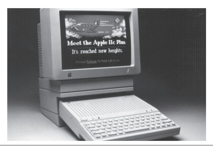
FIGURE 1.12.5 The Apple IIe Plus. Designed by Steve Wozniak, the Apple IIe set standards of cost and reliability for the industry.

But even with a four-year head start, Apple's personal computers finished second in popularity. The IBM Personal Computer, announced in 1981, became the best-selling computer of any kind; its success gave Intel the most popular microprocessor and Microsoft the most popular operating system. Today, the most popular CD is the Microsoft operating system, even though it costs many times more than a music CD! Of course, over the more than 30 years that the IBM-compatible personal computer has existed, it has evolved greatly. In fact, the first personal computers had 16-bit processors and 64 kilobytes of memory , and a low-density, slow floppy disk was the only nonvolatile storage! Floppy disks were originally developed by IBM for loading diagnostic programs in mainframes, but were a major I/O device in personal computers for almost 20 years before the advent of CDs and networking made them obsolete as a method for exchanging data.